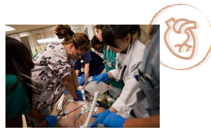
When CPR is performed in a hospital:

Cardiopulmonary resuscitation (CPR) is a group of interventions used to try and restart the heart of an individual that has stopped beating.